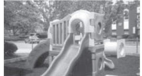
(Above) The new playground looks great! (Below) Children enjoy the resurfaced play area.