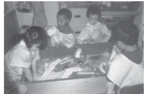
Children explore water play while helping to clean classroom toys.

Toddlers are sensory oriented, exploring their environment through taste, smell, sound, sight and touch. Sensory explorations are encouraged because they are building blocks for more formal learning later on. One way to engage in sensory learning is through water table “play”.